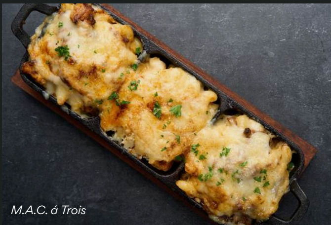
M.A.C. à Trois