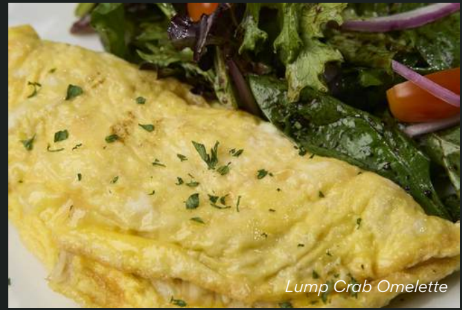
Lump Crab Omelette