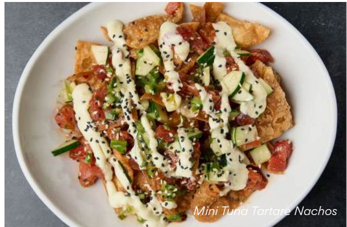
Mini Tuna Tartare Nachos