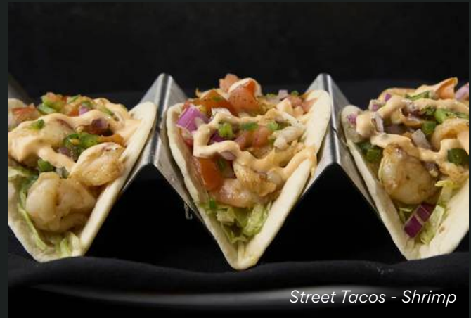
Street Tacos - Shrimp

Menu price is not inclusive of tax & service fee. Menu items are subject to change based upon availability & seasonal changes. *Consuming raw or undercooked meats, poultry, seafood, or eggs may increase your risk of a food borne illness especially when you have a medical condition.