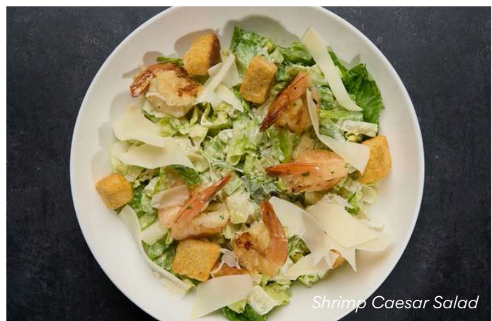
Shrimp Caesar Salad