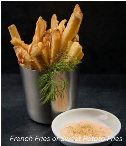
French Fries or Sweet Potato Fries