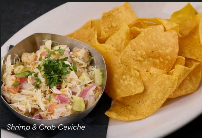
Shrimp & Crab Ceviche