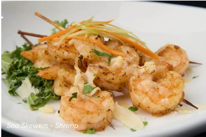
Sea Skewers - Shrimp