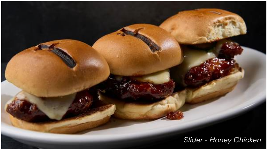
Slider - Honey Chicken