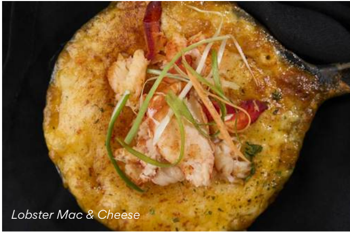
Lobster Mac & Cheese