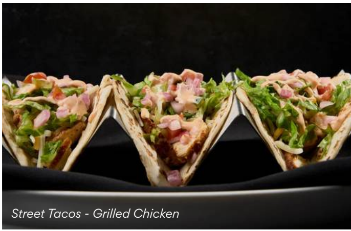
Street Tacos - Grilled Chicken