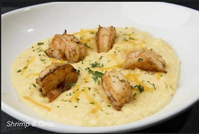
Shrimp & Grits