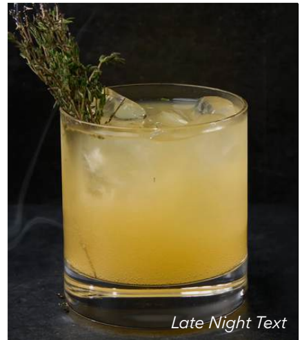
Late Night Text